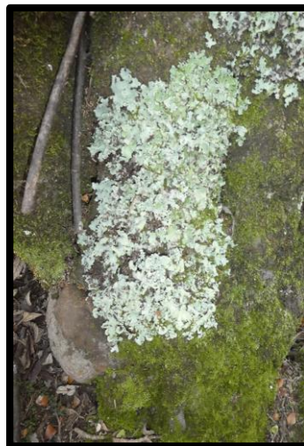
Lichen and mosses (KM)