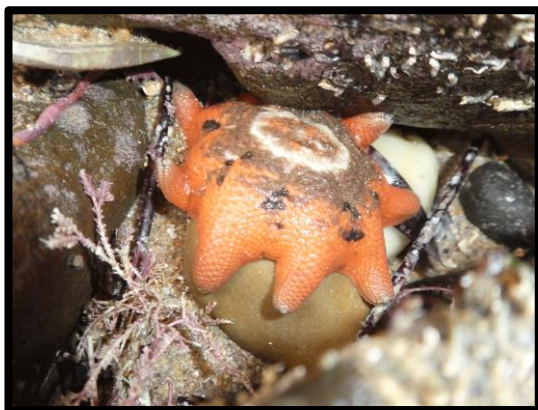
Meridiastra calcar (KM)

Birds: Chroicocephalus novaehollandiae , silver gull; Larus pacificus , pacific gull