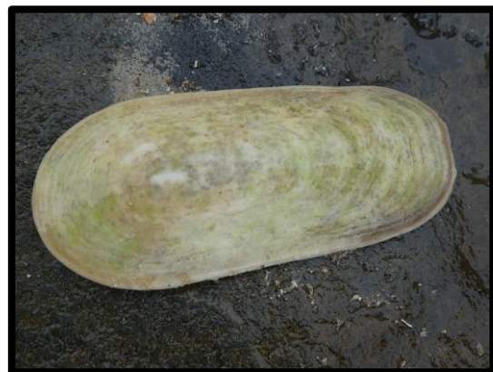
Scutus antipodes (KM)