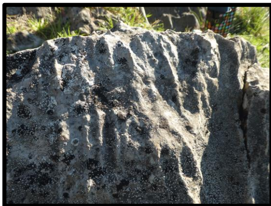
Folds in the limestone